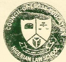
Chairman, Council of Legal Education