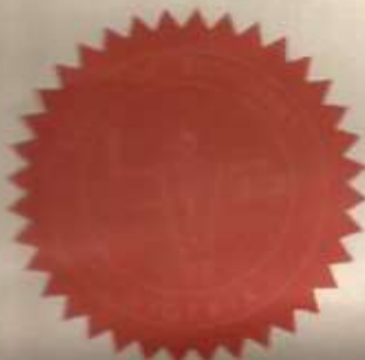
CHAIRMAN BODY OF BENCHERS