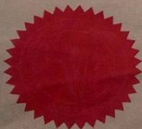
CHAIRMAN BODY OF BENCHERS